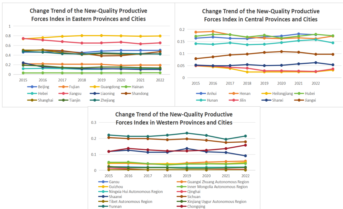
Figure 2 Trend of New Quality Productivity Index in Eastern, Central and Western China